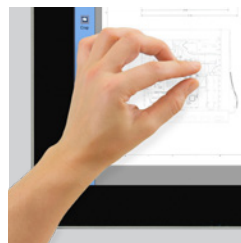
Standard Windows application or intuitive touch-screen mode