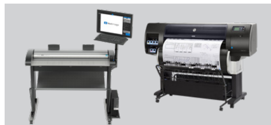
A low stand version is available for side-by-side operation