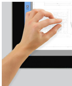
Touchscreen Full HD 21.5" touchscreen