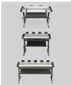
Your choice of scanner IQ Quattro 44 inches HD Ultra X 42 inches HD Ultra X 60 inches