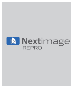
Nextimage REPRO software