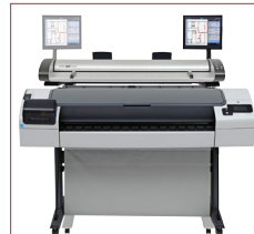
A good ergonomic environment for left- as well as right-handed operation

Contex Head Office Phone: +45 4814 1122 info@contex.com