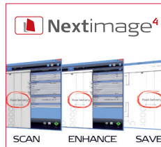
Awarded Nextimage software to ensure image quality for both archival and printing