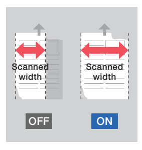
Full length auto size Nextimage full length auto size ensures all available information is scanned even if more than one edge is incomplete.