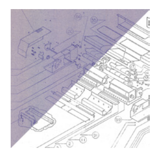
Adaptive threshold algorithm Nextimage comes with a newly developed B&W algorithm that combines background cleaning and preservation of grayscales in one mode. Use it for both clean new originals and for low contrast blueprints.