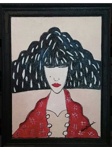
'Geisha' by Eliane Balsewich.

GIS exclusively uses Contex large format scanners such as the Contex IQ FLEX flatbed scanner for thick, framed or dimensional artwork. Vivid